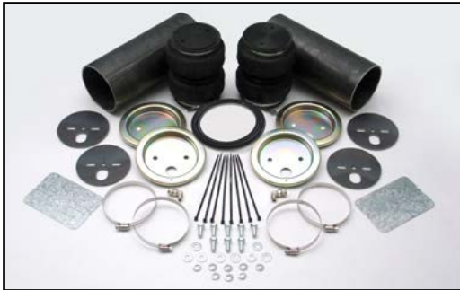
HP10130 (SUGGESTED FOR REAR SUSPENSION)