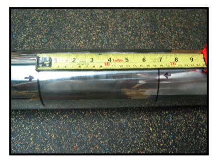
4" Exhaust Only