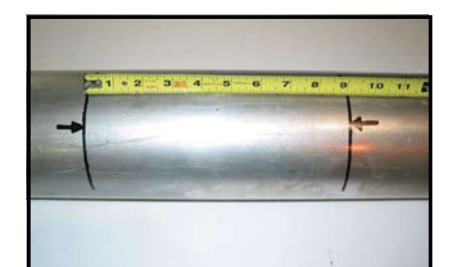
5" Exhaust Only

Select a location that has a minimum of 12" of straight pipe and has sufficient clearance for installation and servicing of the exhaust brake. This location should be as close to the turbocharger as possible and away from dirt and road spray. A 7" section of exhaust pipe needs to be removed. Measured and mark the pipe for cutting.